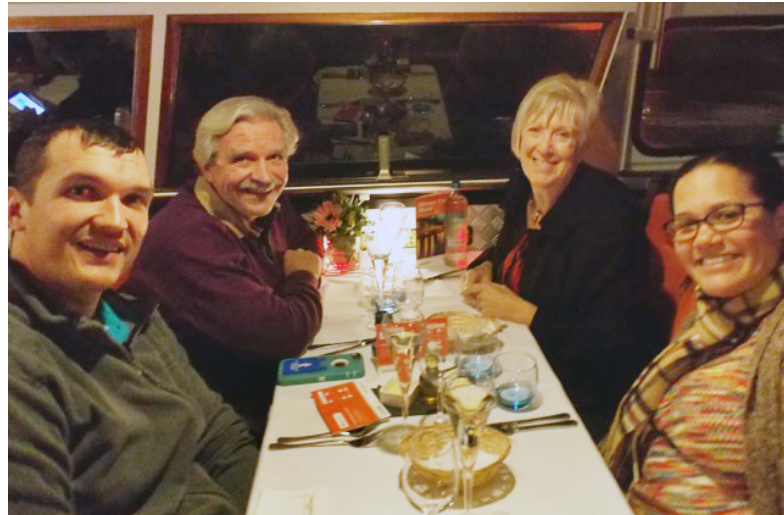
Photo from our recent anniversary trip on Viking River Cruise. (This was not a FAM familiarization trip. All FAM trips are brought before the SCC Board and recorded in the minutes.)